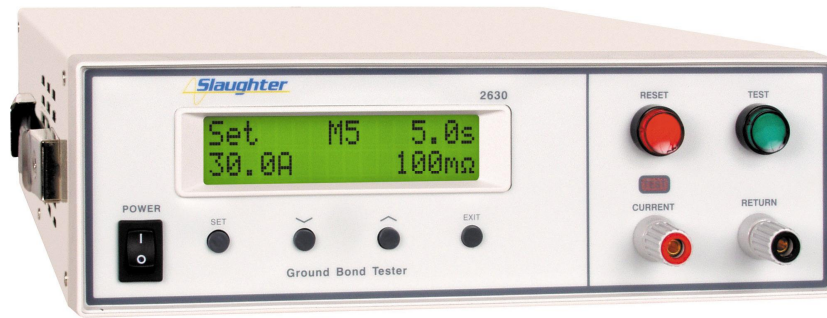
Figure 3.0: Slaughter Company Model 2630

Many manufacturers are concerned about offsetting test lead resistance when performing a Ground Bond test. After all, one of the most important pieces of information which a Ground Bond verifies is the resistance measurement – it is crucial that this measurement be accurate. Instruments like the Slaughter Model 2630 compensate for this issue by incorporating an “Auto-offset” feature. With this feature, the test operator can intentionally subtract (hence the term “offset”) the resistance of the test leads and any other fixturing during a Ground Bond test, making the final resistance measurement of the DUT’s earth ground conductor more accurate. This feature assures that a good test is being performed.