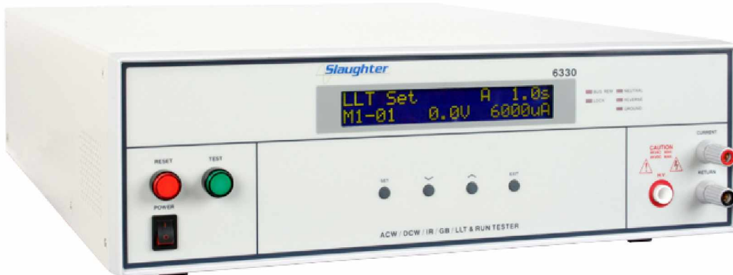
Figure 1.0: Model 6330 6-in-1 Electrical Safety Tester (including LLT)

The Line Leakage test is actually a general term that is used to describe a series of tests. There are 4 different types of LLT's: Earth Leakage test, Enclosure Leakage test, Patient Leakage Current test, and Patient Auxiliary Current test (we will discuss each type of test later in the document). Each test is performed under nominal operating conditions as well as in a variety of fault conditions. These fault conditions provide us with valuable information about how a product's leakage current will behave if operated incorrectly.